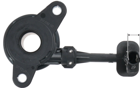
Fig. 4: CSC 3182 600 140 → 3182 654 204 Hydraulic connection diameter: 12.2 mm

Hydraulic connections of the release devices are not to scale.