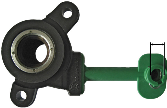
Fig. 1: CSC 3182 600 121 → 3182 654 165 Hydraulic connection diameter: 11.7 mm